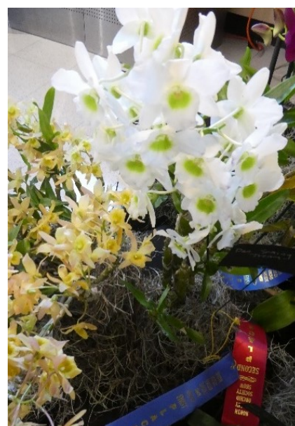
2 nd Den. Spring Dream Y Brona