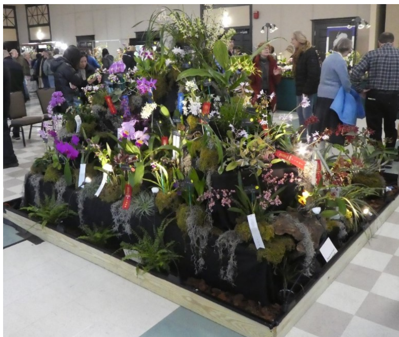
North Jersey Orchid Society