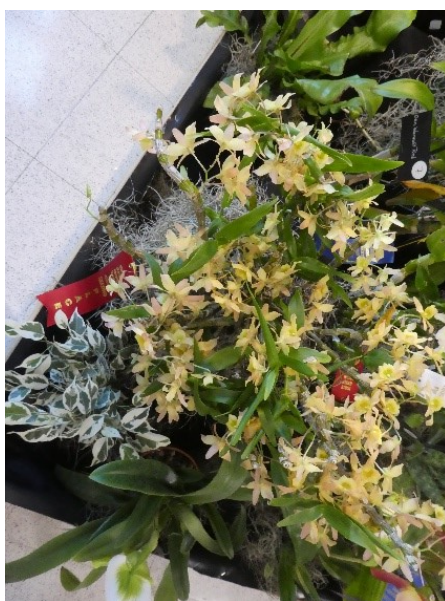
2 nd Den. Spring Bird Kurashiki AM/AOS Y Brona