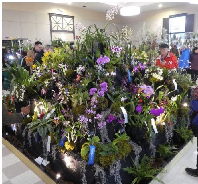
North Jersey Orchid Society