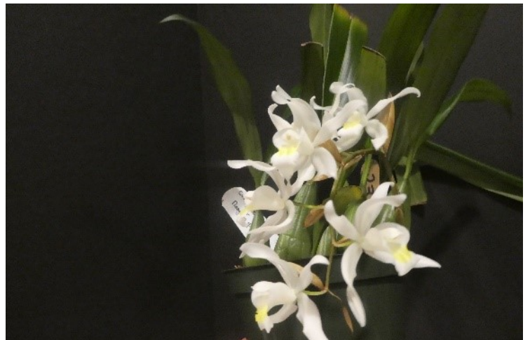
3. Coelogyne gardneriana