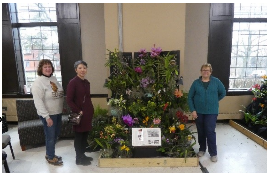
Just a few p